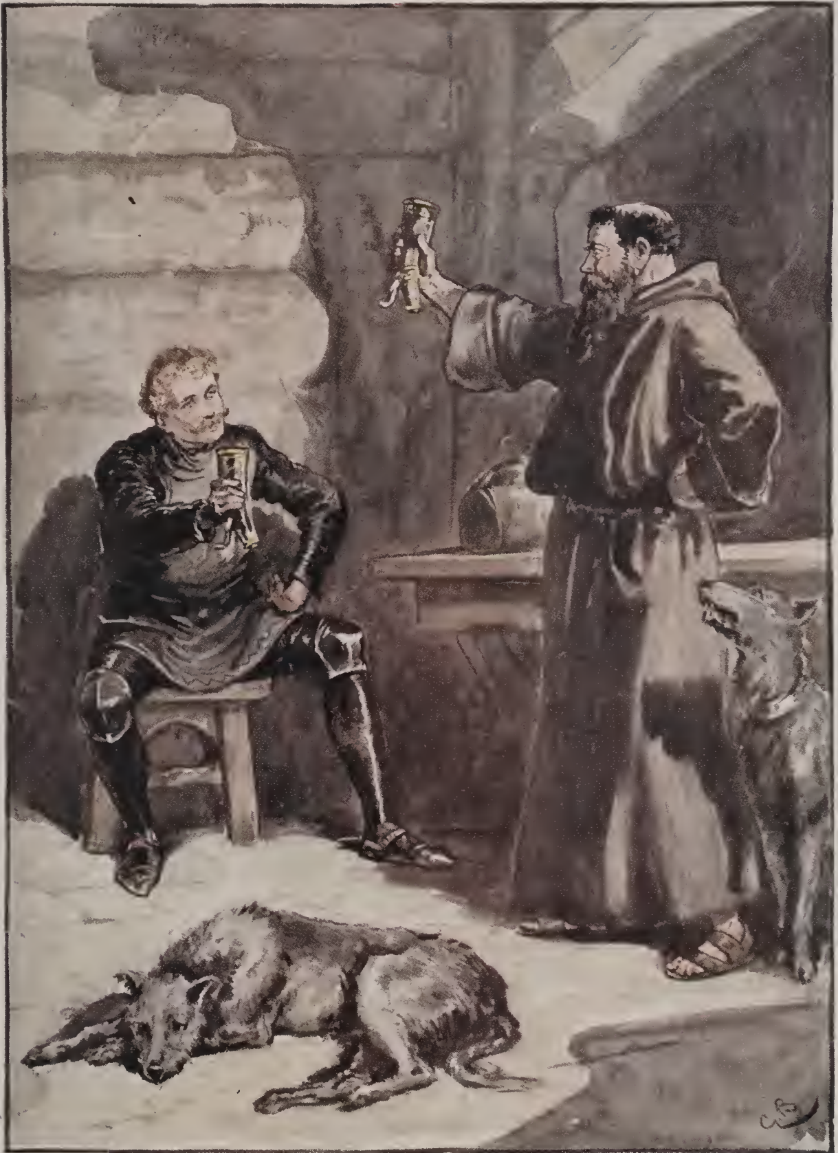
THEY ATTACKED THE WINE AND PASTRY VALIANTLY.